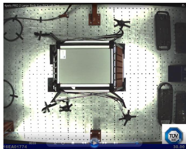
“Pick Up” Test set up